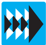
③ Competency Model