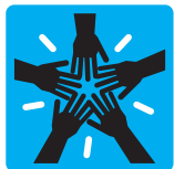
② Team Building