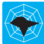
⑦ Personal Assessment