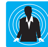
⑩ Executive Presence