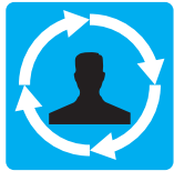
① Organizational Climate Design