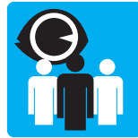
⑤ Recruitment Strategy