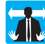
⑨ Leadership Coaching