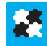
⑪ Executive Team Development